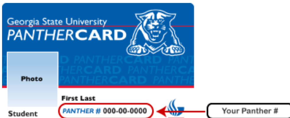
Figure 2: Panther # on PantherCard

Your initial password for PantherMail is your Panther # without the dashes . Your Panther # is located on the front of your PantherCard below your name.