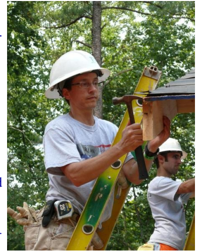
Georgia State University College of Law students volunteer to assist building Habitat for Humanity houses.